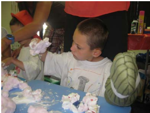
Firefighter Adventure Day

Adventure Camp is designed to maximize a child's potential and develop their strengths and hidden abilities while providing an opportunity to stimulate a child's awareness and interest in their environment and in relationships, while building their confidence, self-esteem and growth towards independence.